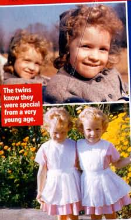
The twins knew they were special from a very young age.